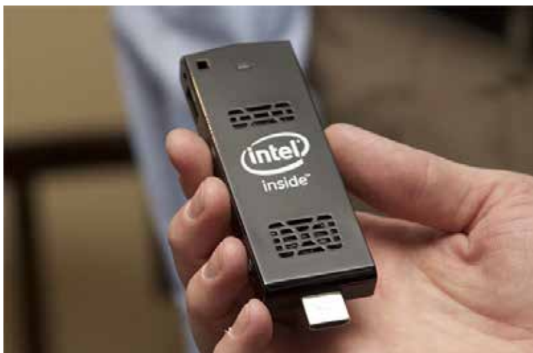
PowerPlayer PC Stick

PowerPlayer is a low-cost Windows® 10 PC stick that plugs into your TV's HDMI source input. It's a pocket-sized media player designed to display PowerPoint presentations. Your purchase also includes PowerSignage™, our cloud-based content management service.